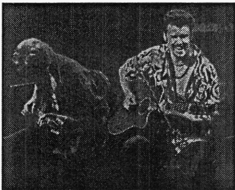
■ Providing an acoustic interlude during the Aberdeen concert are Stuart Adamson (right) and Bruce Watson.